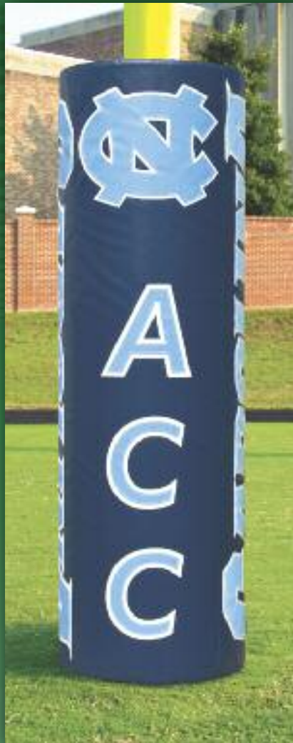
GPP201 Size: 6'x 22" • Cut and sewn letters