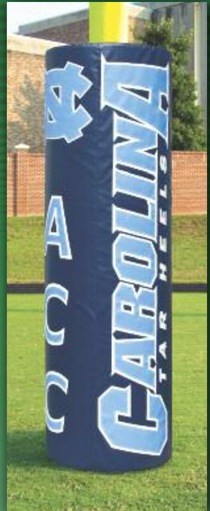
GPP201 Size: 6'x 22" • Cut and sewn letters

* see pages 48-49 for more goal post pads