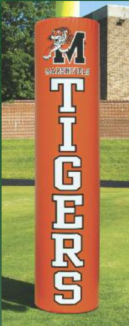
GPP3017 Size: 7'x 18" • Digitally printed